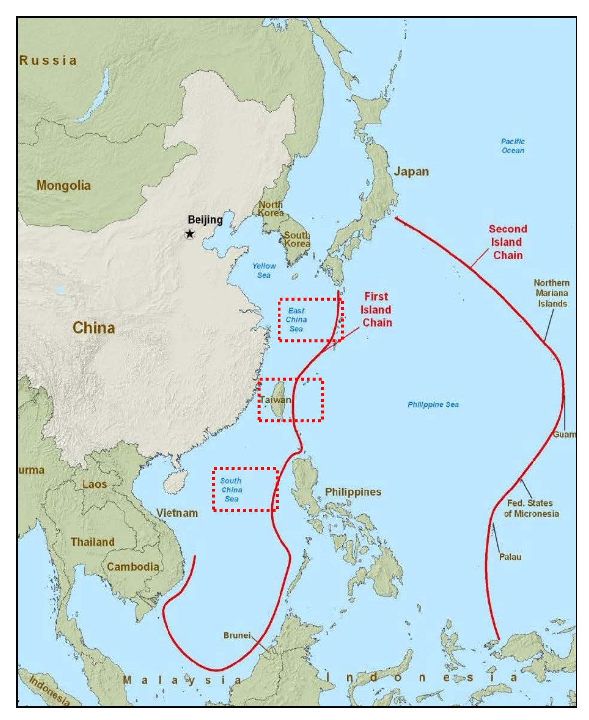
Figure 1: Regional flashpoints and the First and Second Island Chains<sup>35</sup>

of miscalculations occurring in the East and South China Seas.<sup>34</sup> While none has been serious enough to turn a flashpoint into a hot war, or even a limited military confrontation, the risks appear to be increasing.