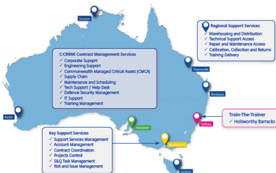
Babcock's support solution for the C-CBRNE capability

Babcock will provide support to the Commonwealth through our Melbourne office. This will be augmented through the company's Regional Support Centre in Adelaide and services across Australia.