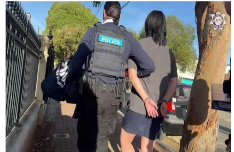
A South Australian army reservist was arrested after he allegedly working for Ukrainian military without authorisation.