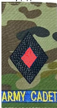
NATIONAL ADJUTANT & TRAINING OFFICER (CUO) (Appointment)