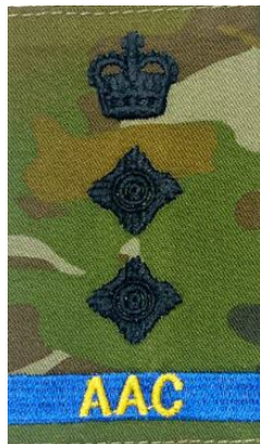
COL (ACS) NATIONAL ASSISTANT COMMANDER