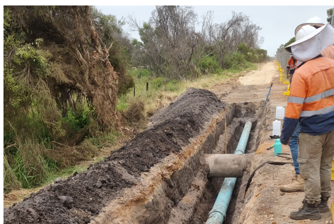
Pipeline installation in progress on Raphael Road, Bullsbrook.

This process is expected to begin in early 2025.