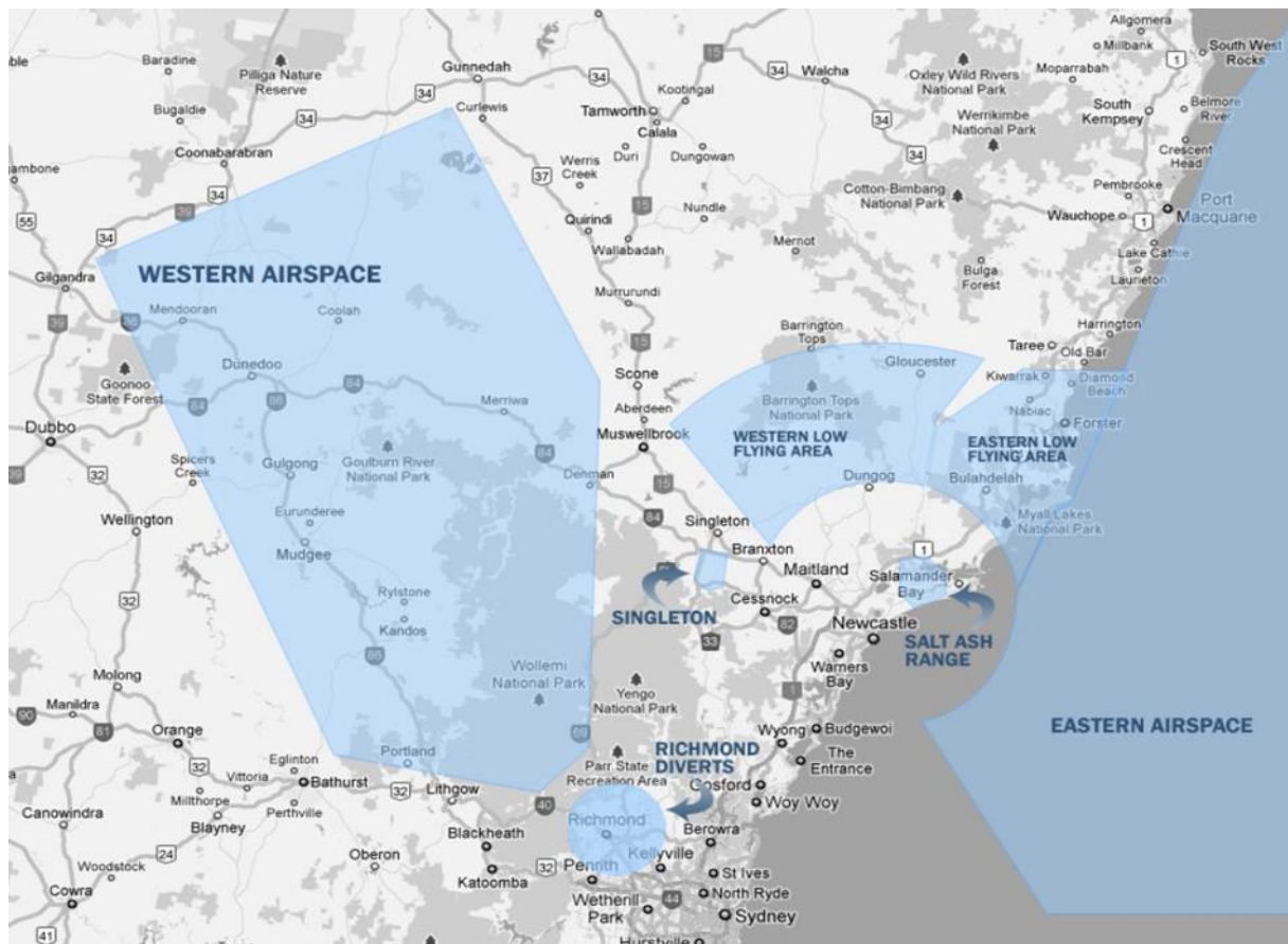
Figure 1: RAAF Base Williamtown Airspace

26. In addition to the SAAWR, aircraft operating from RAAF Base Williamtown utilise nearby General Flying Training Areas (GFTAs) and Low Flying Areas (LFAs) for training and exercises. The locations of the local training areas are shown in Figure 1.