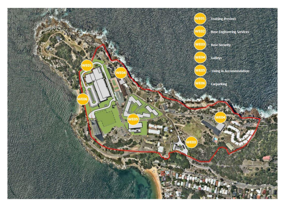
Figure 2: Scope of works