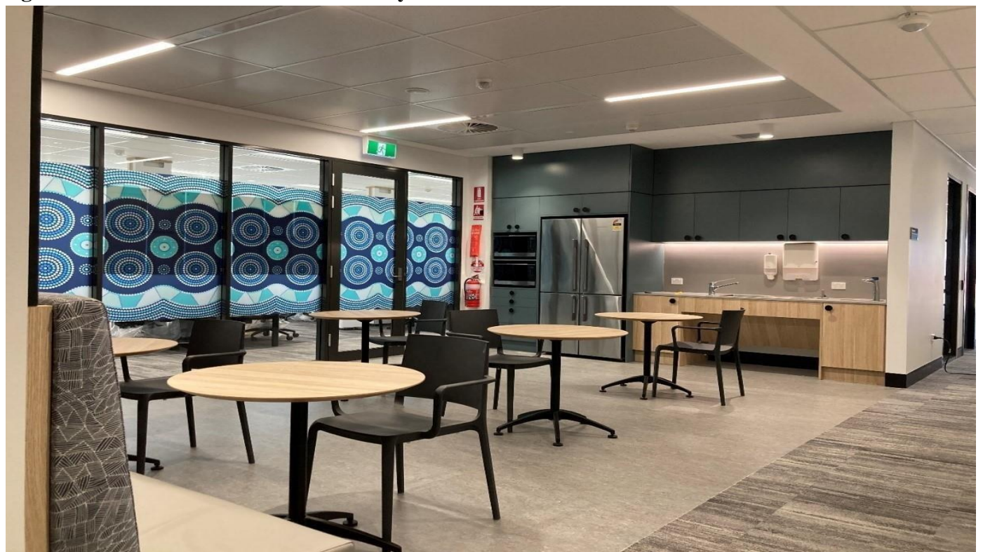
Figure 5: Diamantina Shared User Facility