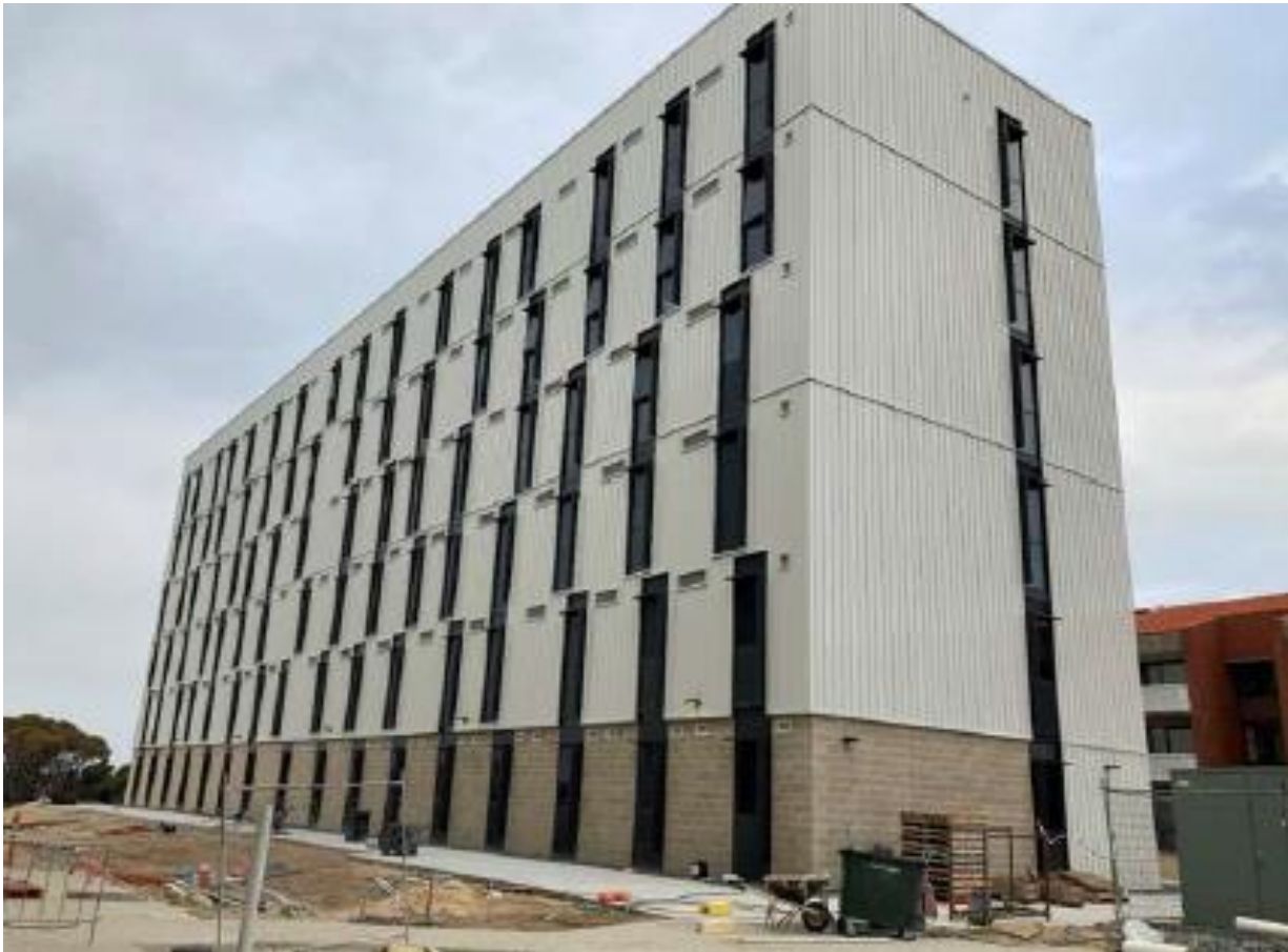
Figure 9: Accommodation