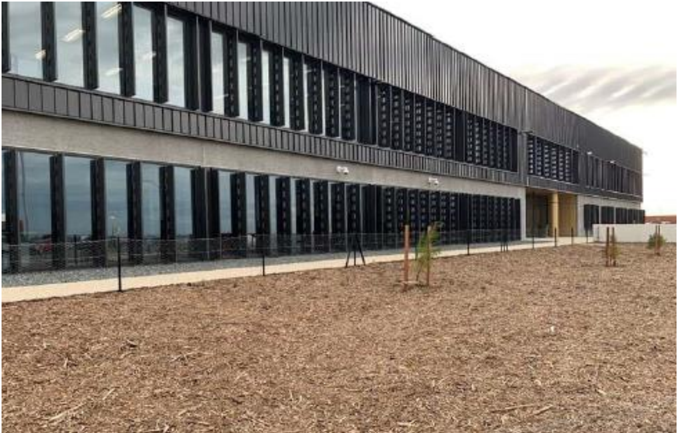
Figure 6: OPV and Frigate Support Facility – “Oxley Shared User Facility”