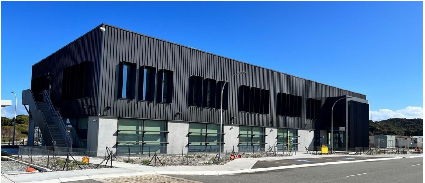
Figure 4: Diamantina Shared User Facility

The Diamantina Shared User Facility was completed in May 2022.