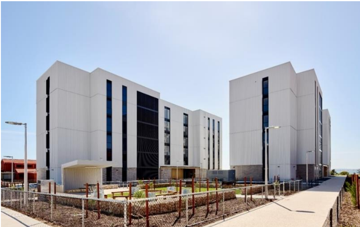
Figure 10: Accommodation