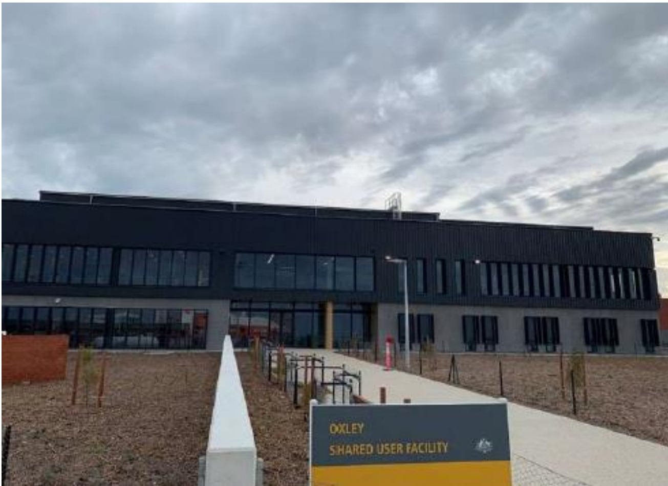
Figure 7: OPV and Frigate Support Facility – “Oxley Shared User Facility”