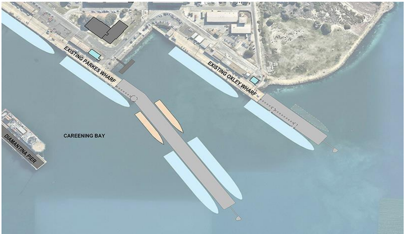
Figure 2: HMAS Stirling Proposed Extension to Maritime Structures (extensions shown in grey)

The Armament Wharf Extension (AWE), completed in June 2021, consisted of a 251 metre perpendicular extension to the end of the existing Armament wharf structure. The works also included new deck and dolphins to support berthing and mooring of larger vessels. Refer to Figure 4 for a photo of the completed AWE Wharf.