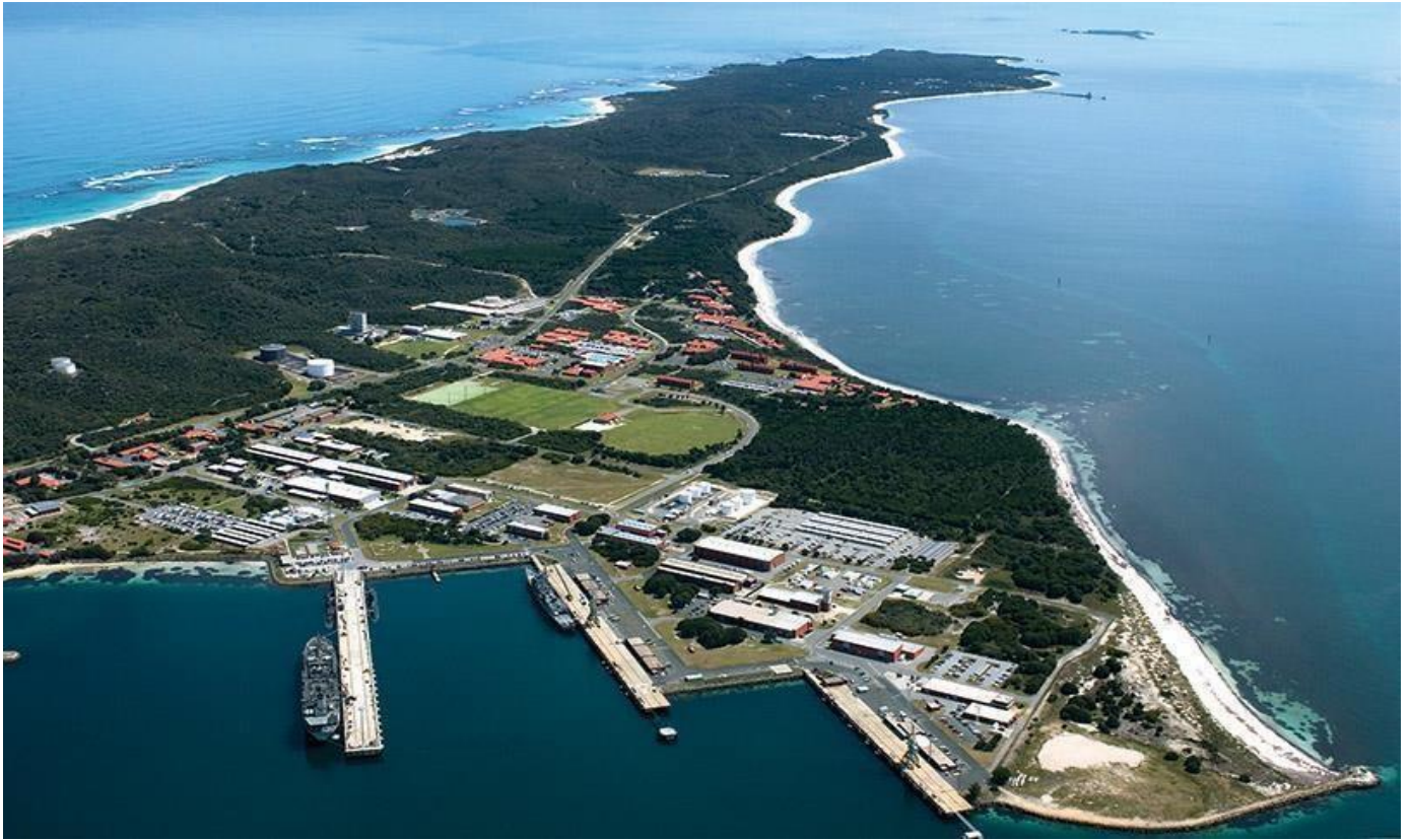
Figure 1: HMAS Stirling Aerial View

HMAS Stirling is an existing Defence establishment located 50km south of the City of Perth on Garden Island. HMAS Stirling is the Royal Australian Navy's primary base on the west coast of Australia. This base is also known as Fleet Base West.