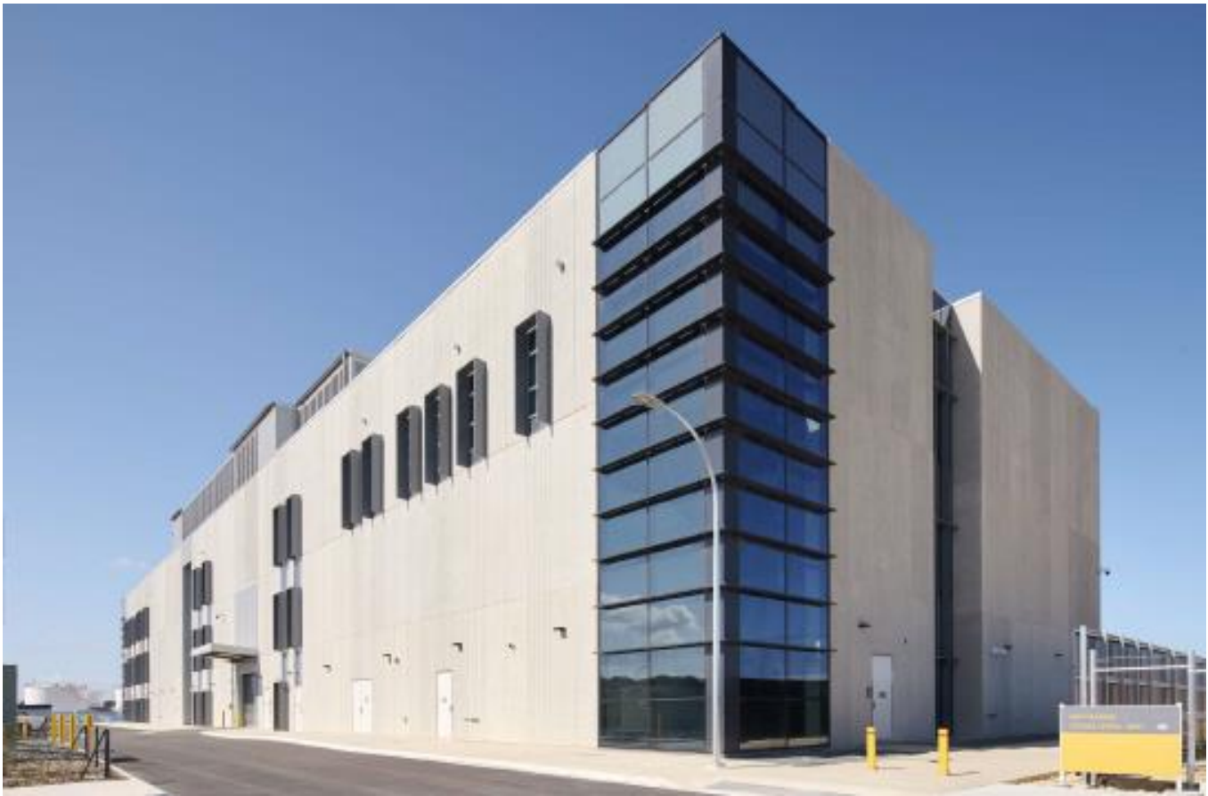
Figure 8: Training Centre

The training precinct will feature a training centre with classrooms, theatre, specialists training rooms, bridge simulator, and office accommodation.