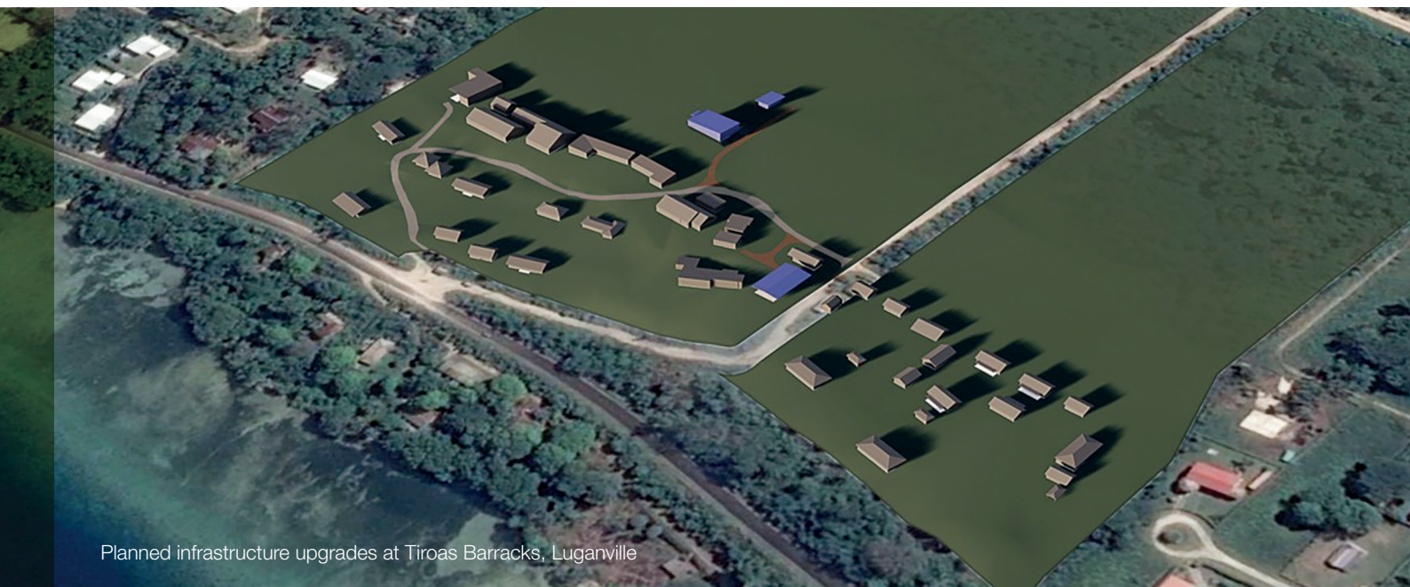
Planned infrastructure upgrades at Tiroas Barracks, Luganville