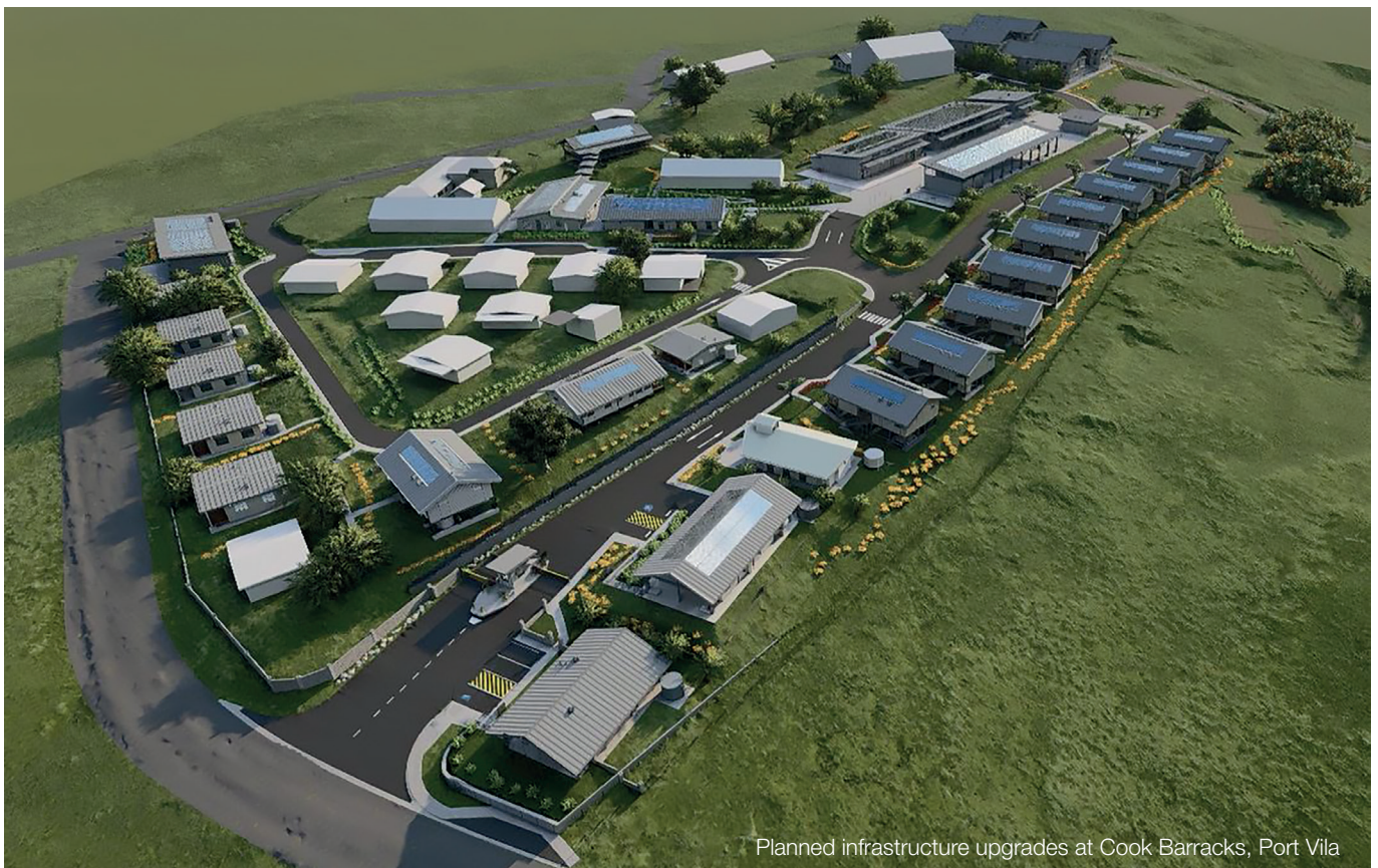
Planned infrastructure upgrades at Cook Barracks, Port Vila

The Governments of the Republic of Vanuatu and Australia are working together to deliver a large infrastructure project for the Vanuatu Police Force in Port Vila and Luganville, as part of the strong and enduring security partnership between our two nations. The enhanced and resilient infrastructure and facilities support the Vanuatu Police Force's growth and operational capability.