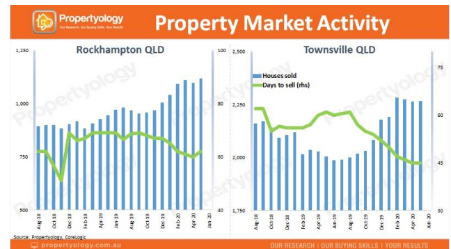
Image: Rockhampton and Townsville property prices