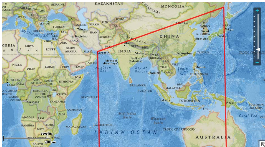
Figure 1: Indo-Pacific Region 8

interests and actions of India, China and the US but does not imply exclusion of strategic influences and influencers from outside this specified area.