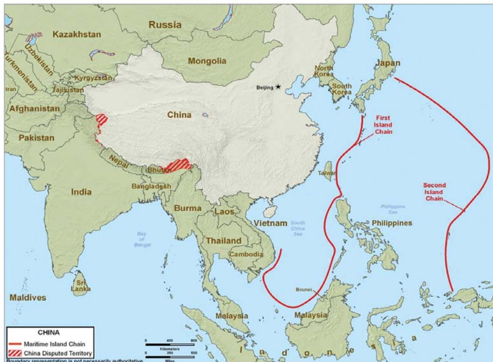
Figure 3. The First and Second Island Chains. PRC military theorists conceive of two island “chains” as forming a geographic basis for China’s maritime defensive perimeter.