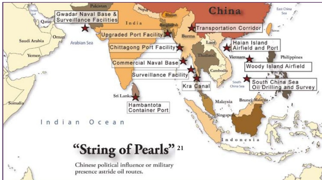
Figure 2: ‘String of Pearls’ 55

India’s status as a nuclear state has afforded it greater influence and confidence. India declared that its nuclear capability was a response to China’s rise and its nuclear arming of Pakistan, 56 which dislocated China as the US used the opportunity to engage India more closely. Certainly its more aggressive response to the threat of Chinese containment has surprised Beijing. 57