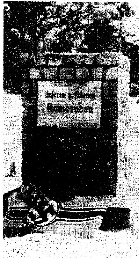
The plaque on this Hamburg memorial reads: "Our fallen comrades".