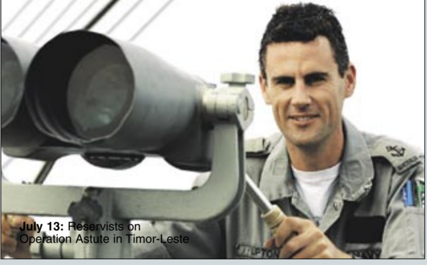
July 13: Reservists on Operation Astute in Timor-Leste

It saw him take the controls of a single-engine Cessna at Redcliffe Airport on June 27 and fly 133 nautical miles to Chinchilla in rural Queensland.