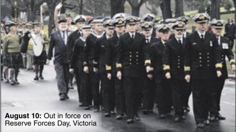
August 10: Out in force on Reserve Forces Day, Victoria

To view back copies, visit http://www.navy.gov.au/reserves_new/NewsRoom/reserveNews_overview.cfm