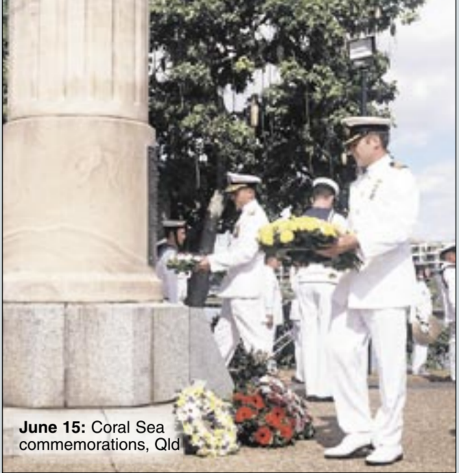
June 15: Coral Sea commemorations, Qld