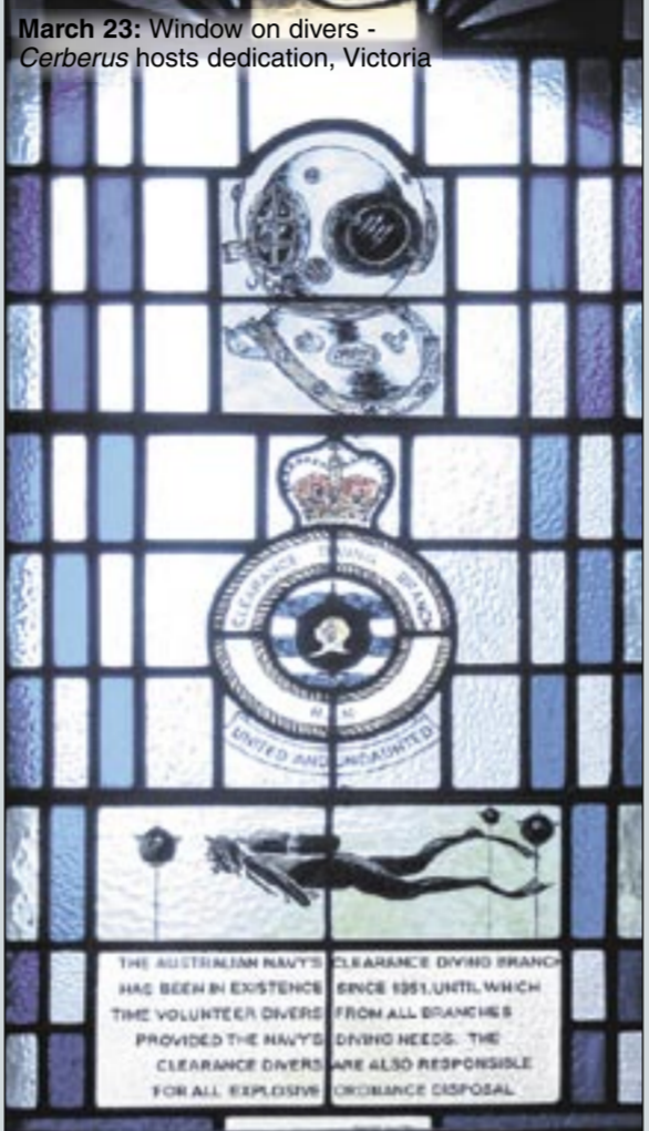
March 23: Window on divers - Cerberus hosts dedication, Victoria