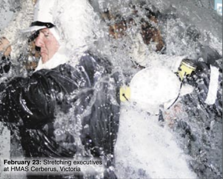
February 23: Stretching executives at HMAS Cerberus, Victoria