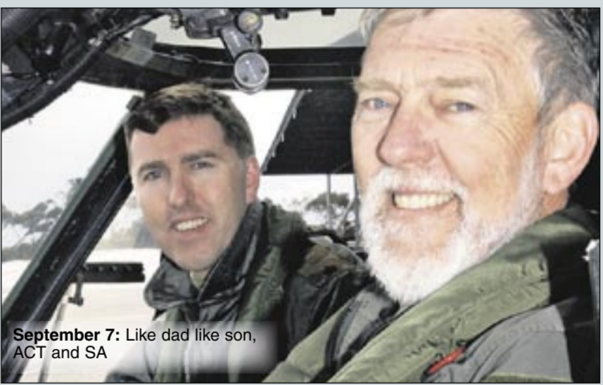
September 7: Like dad like son, ACT and SA