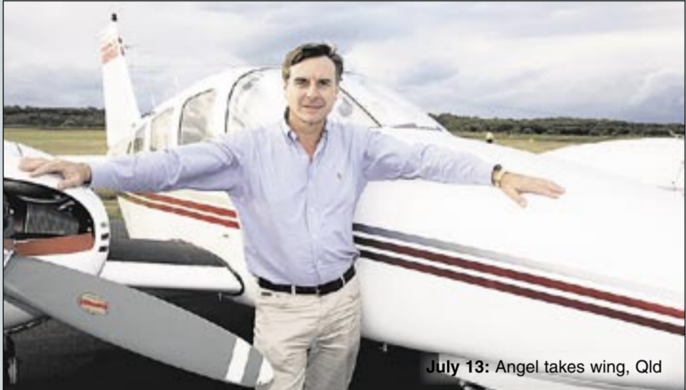
July 13: Angel takes wing, Qld

Exercise Executive Stretch No. 23 at HMAS Cerberus late last year produced some morale-building experiences for a group of Victorian executives as well as high praise for the Navy Reservists who led them through the course. The individual exercise activities placed emphasis on the team work and leadership skills Reservists can bring to their civilian employment.