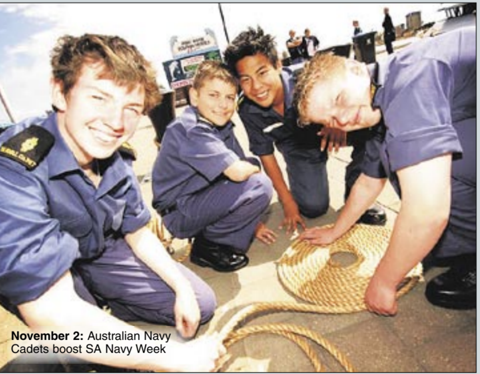
November 2: Australian Navy Cadets boost SA Navy Week