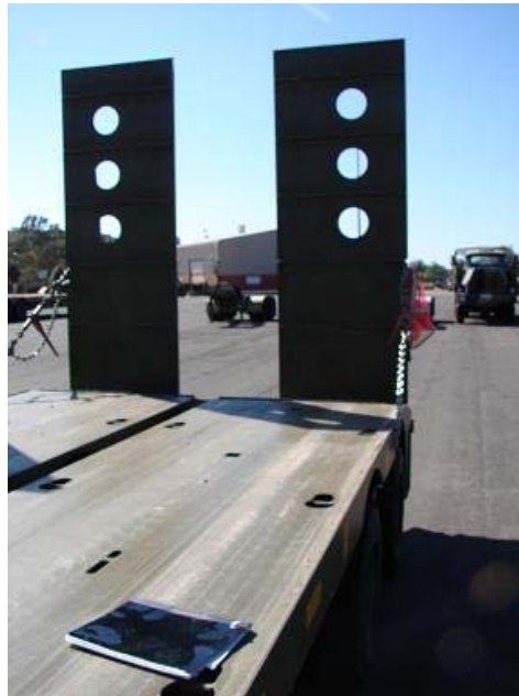
Figure 91–30: Drake Trailer Ramp