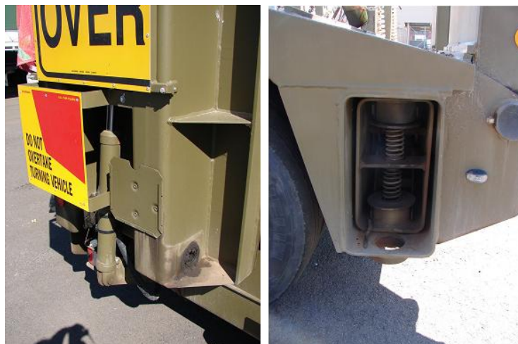
Figure 91–31: Drake Trailer Ramp Hydraulics