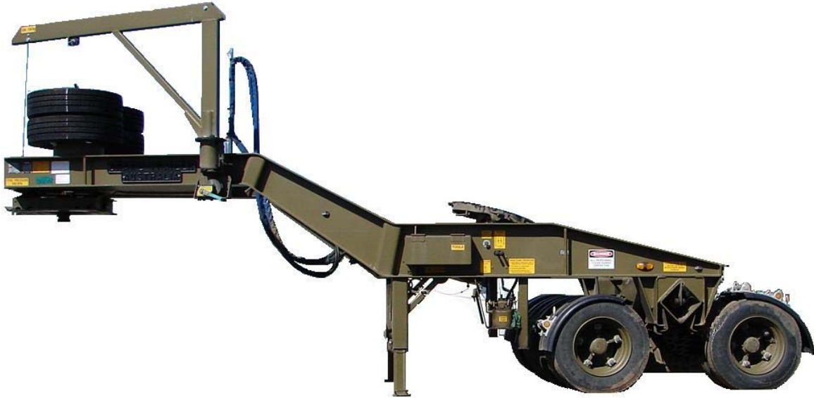
Figure 91-18: Expanding Dolly Converter

91.10 The cleaning instructions for the expanding dolly converter, as illustrated in Figures 91-18 to 91-21, include the points detailed in Table 91-6.