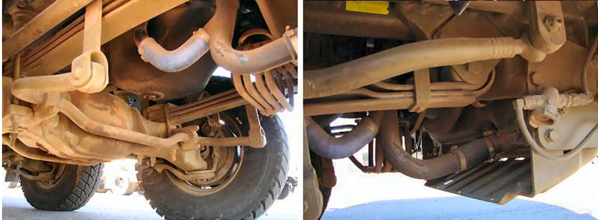
Figure 91-15: Prime Mover's Front Wheels Suspension and rear of Bumper/Scrape Guard

91.9 The cleaning instructions for the prime mover's suspension, as illustrated in Figures 91-15 to 91-17, include the points detailed in Table 91-5.