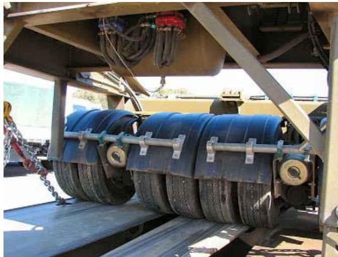
Figure 91-24: Expanding Dolly Front of Wheels