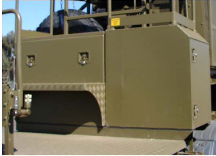
Figure 91-4: Prime Mover Main Stowage Bins