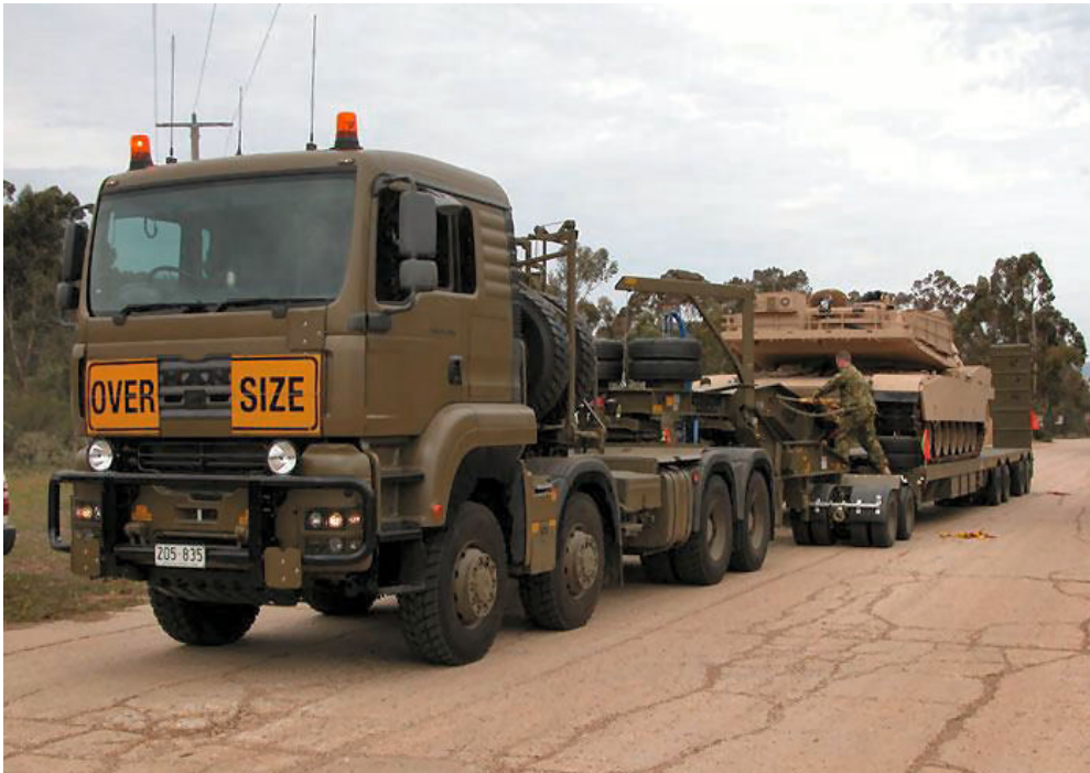
Figure 91–1: Heavy Tank Transporter