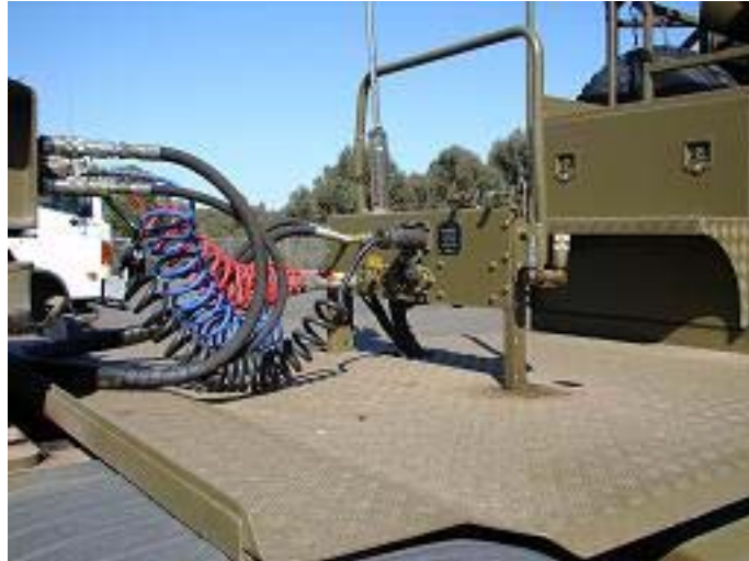
Figure 91-14: Prime Mover Hydraulic and Air Lines

Do not use high pressure water or steam to clean the hydraulics or hydraulic control areas unless under the supervision of a qualified technician