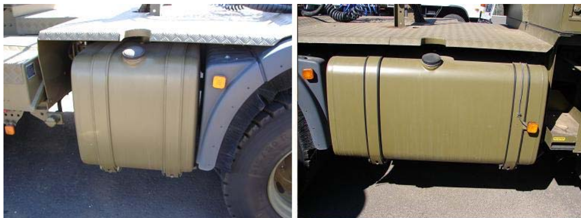
Figure 91–3: Prime Mover Fuel Tanks

91.5 The cleaning instructions for the prime mover's external areas, as illustrated in Figures 91-2 to 91-11, include the points detailed in Table 91-1.