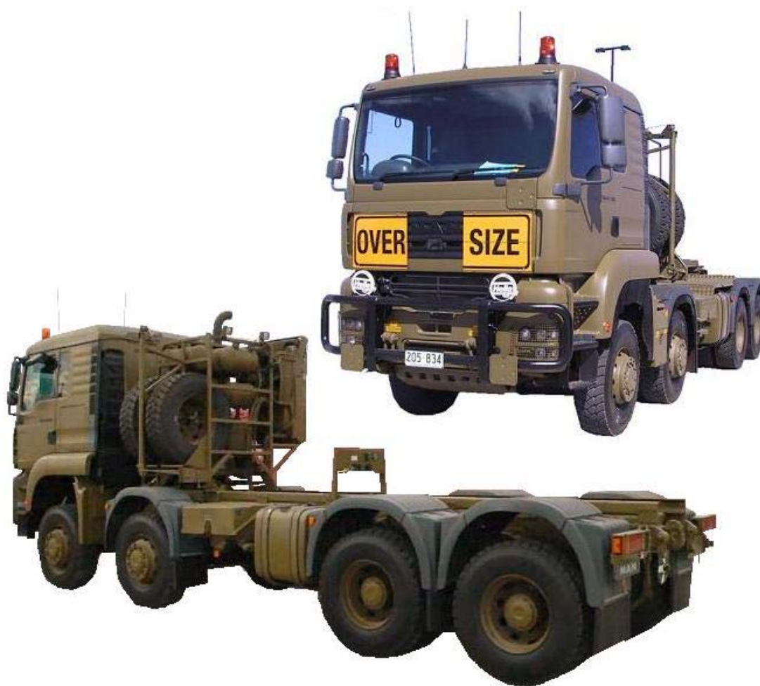
Figure 91–2: MAN H76 41.530 8x8 Prime Mover

91.5 The cleaning instructions for the prime mover's external areas, as illustrated in Figures 91-2 to 91-11, include the points detailed in Table 91-1.