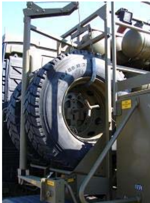
Figure 91-11: Prime Mover Spare Tyre Mount and Winch