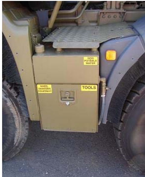
Figure 91-5: Prime Mover Water and Wheel Change Tool Box