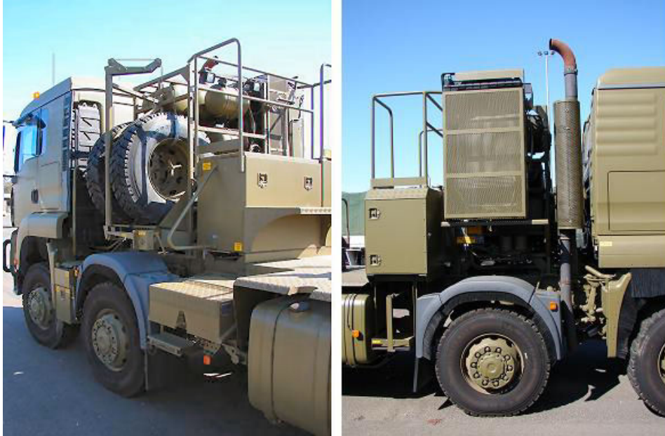
Figure 91-12: Prime Mover Hydraulic and Air Lines