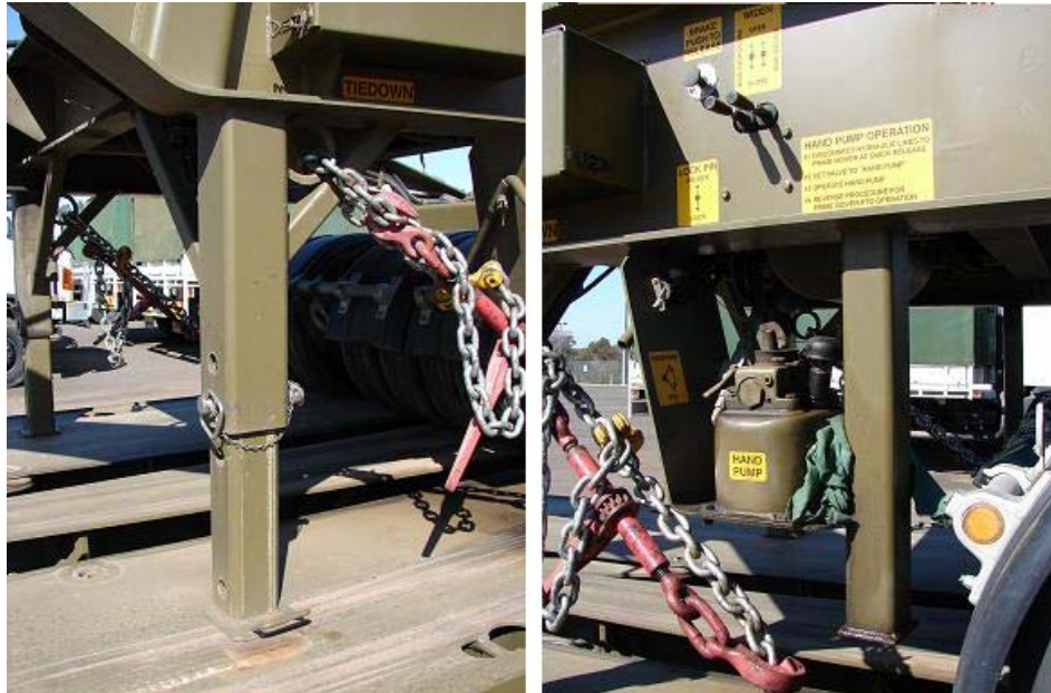
Figure 91–22: Expanding Dolly Converter Support Stand Left Side (Left) and Right Side (Right)

91.11 The cleaning instructions for the Expanding Dolly Converter Supports and Stands, as illustrated in Figure 91–22, include the points detailed in Table 91–7.