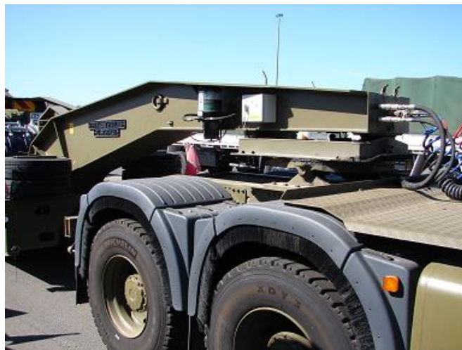
Figure 91–28: Drake Trailer Extension Arm and Turntable