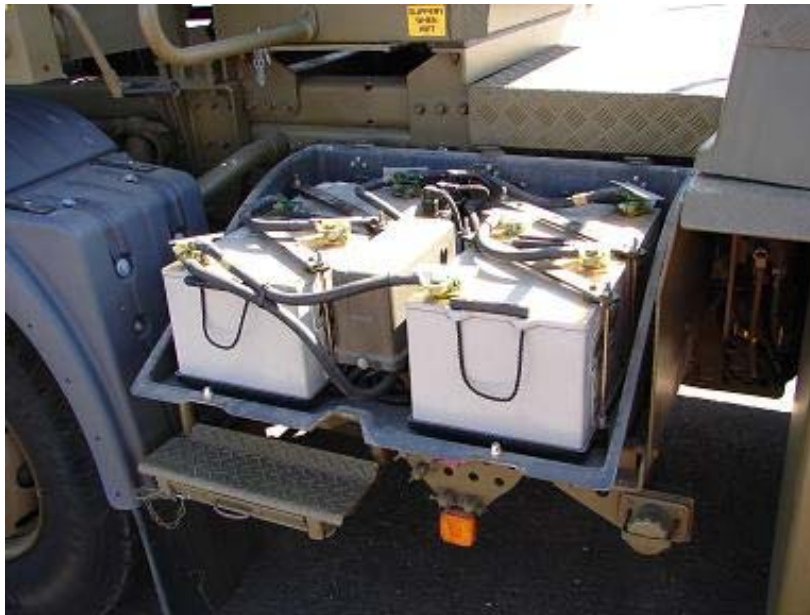
Figure 91-10: Prime Mover Battery Bay