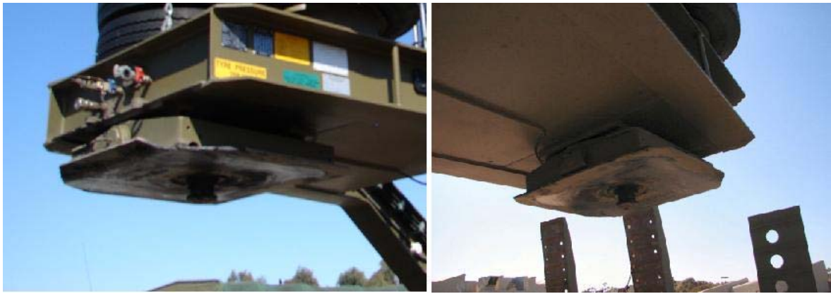
Figure 91–20: Expanding Dolly Converter Connecting Plate