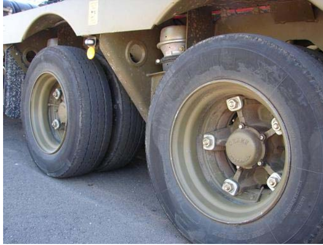
Figure 91–33: Drake Swing-wing Trailer's Suspension

91.16 The cleaning instructions for the Drake Swing-wing Trailer's suspension, as illustrated in Figure 91-33, include the points detailed in Table 91-12.