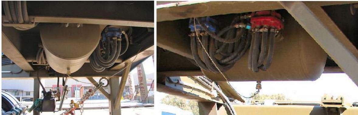
ADF FORCE EXTRACTION CLEANING MANUAL This equipment is not currently approved for deployment