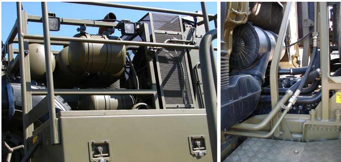
Figure 91-13: Prime Mover Hydraulic and Air Lines