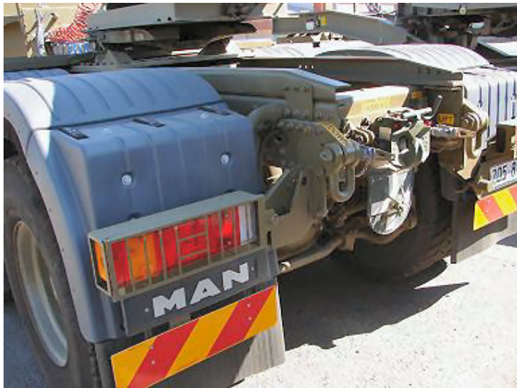
Figure 91-7: Prime Mover Rear View