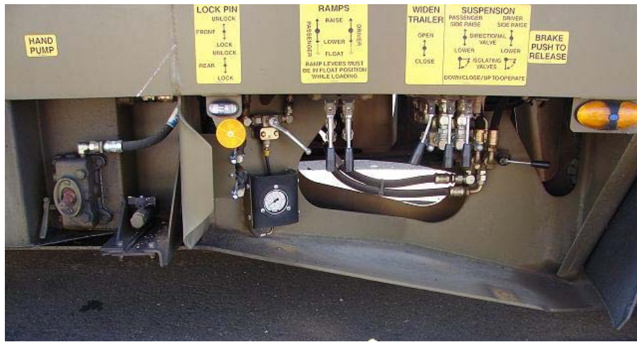
Figure 91-34: Drake Swing-wing Trailer's Hydraulic Controls

91.17 The cleaning instructions for the Drake Swing-wing Trailer's hydraulics, as illustrated in Figures 91-34 and 91-35, include the points detailed in Table 91-13.