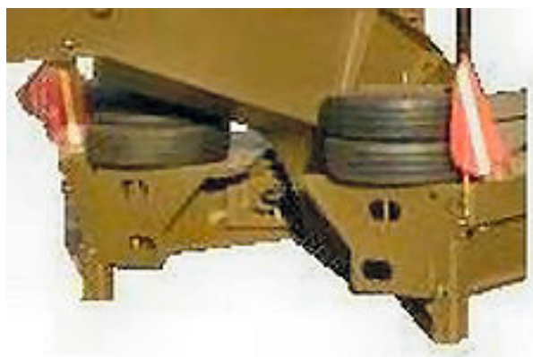
Figure 91–32: Drake Trailer Spare Tyre Mounts