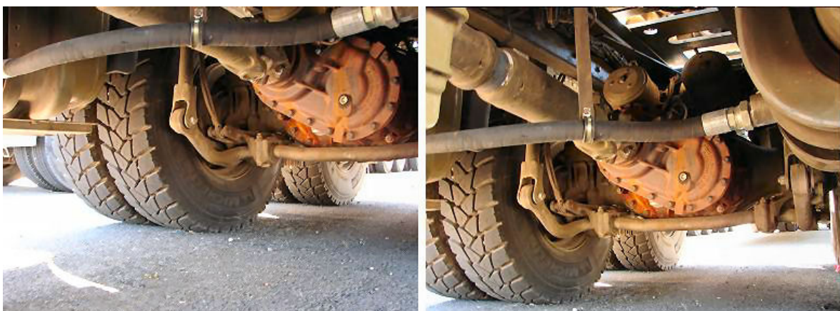
Figure 91-17: Prime Mover's Rear Wheels Suspension and Differential