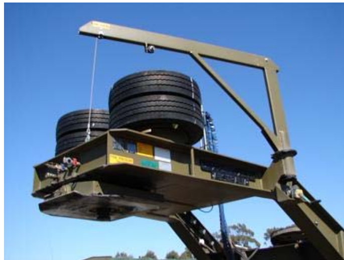
Figure 91–21: Expanding Dolly Converter Spare Tyre Mounts