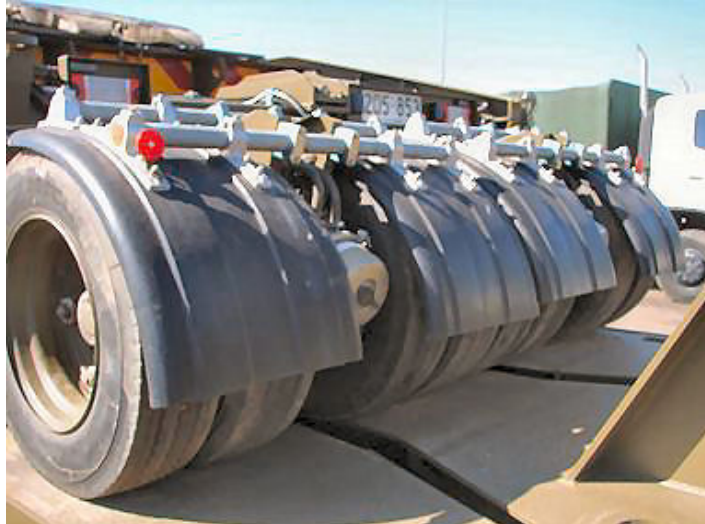
Figure 91-23: Expanding Dolly Converter's Rear of Wheels