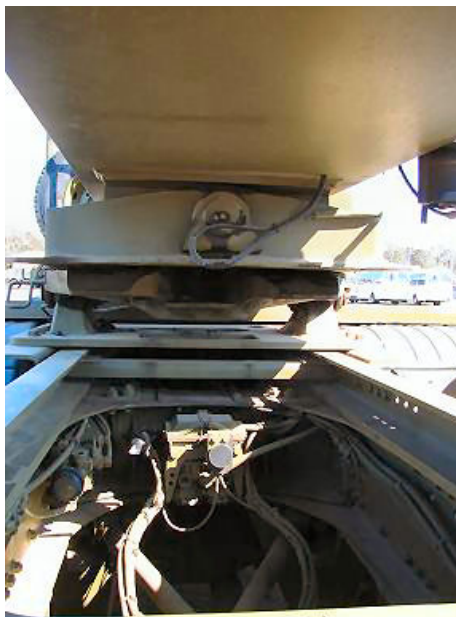
Figure 91-9: Prime Mover Turntable and Hydraulics