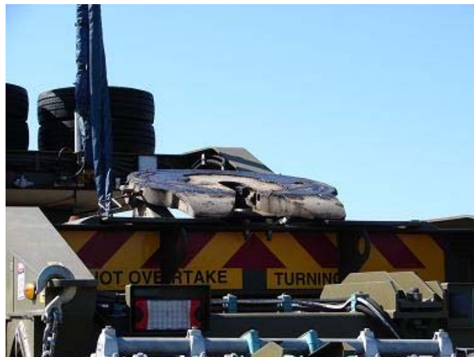
Figure 91-19: Expanding Dolly Converter Turntable