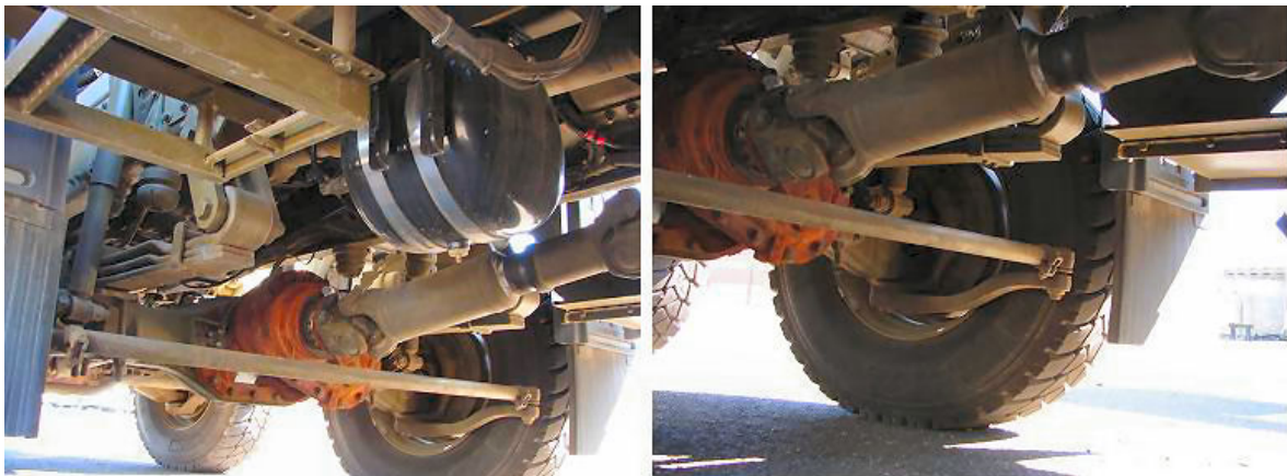
Figure 91-16: Prime Mover's Front Wheels Suspension and Tail-shaft