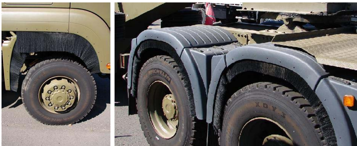
Figure 91-6: Prime Mover Front and Rear Wheel Anti-splash Fittings