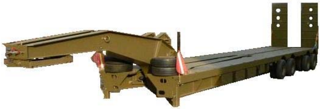
Figure 91–27: Drake 4x8 Expanding Deck, Swing-wing Trailer

91.14 The cleaning instructions for the Drake Trailer, as illustrated in Figures 91-27 to 91-32, include the points detailed in Table 91-10.