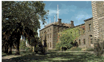
Historic Victoria Barracks, venue for the joint PACS/PALMS Forums.

sentatives will have fond memories of PACS WG3 which was held in Melbourne in early 1996. For those first time visitors I have included a brief history of my home town and some pictures I took on an extremely warm day (42C).