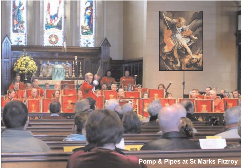
Pomp & Pipes at St Marks Fitzroy