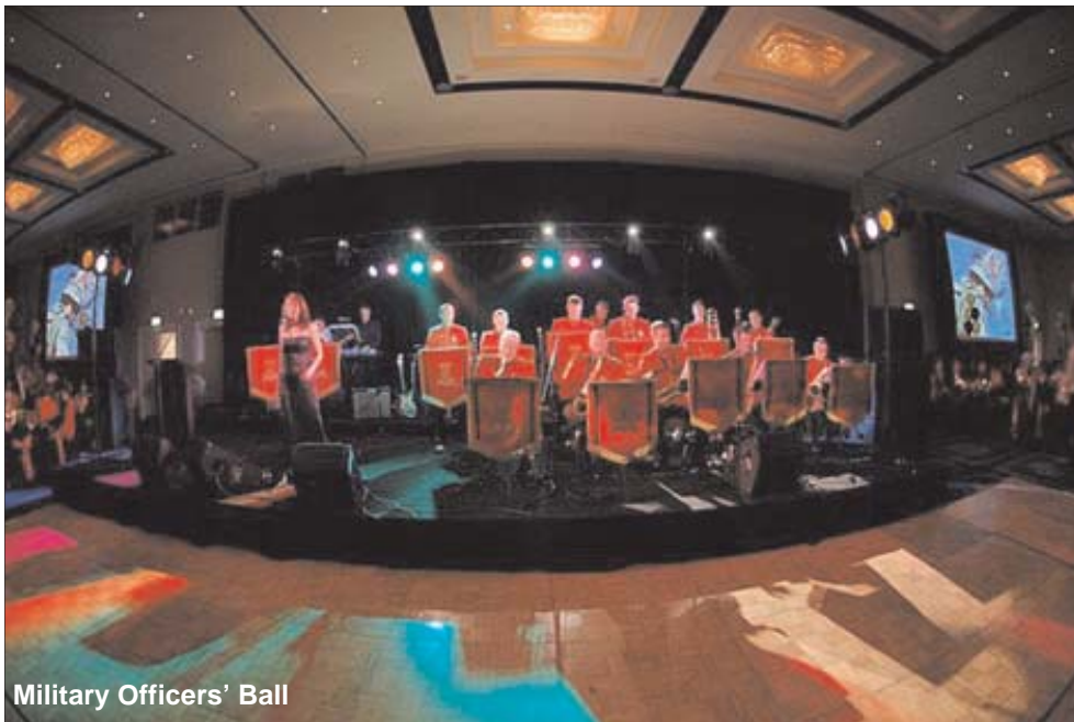
Military Officers' Ball