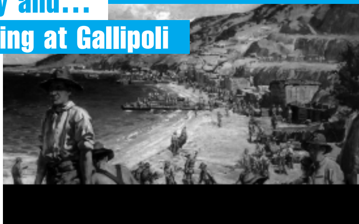
Frank Crozier, The Beach at Anzac Cove , 25 April 1915 AWM ART 02161