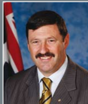
The Hon Dr Mike Kelly, AM, MP Parliamentary Secretary for Defence Support

With 2010 being an election year, there is an understanding that your time will be in even greater demand this year. However, the Australian Defence Force Parliamentary Program is tailored to fit the most opportune times in the parliamentary sitting calendar and I encourage you wholeheartedly to consider signing up to the program in 2010.