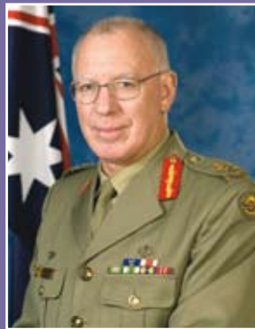
Lieutenant General David Hurley, AO, DSC Vice Chief of the Defence Force

The 2010 Australian Defence Force Parliamentary Program builds on the great success of the 2009 program offering an excellent suite of options to showcase the Australian Defence Force's multifaceted training activities and our ability to deliver effective capability on operations. On behalf of the Chief of the Defence Force, Air Chief Marshal Angus Houston, AC, AFC, and the wider Defence community I extend a warm invitation for you to participate in this exciting 2010 Australian Defence Force Parliamentary Program.