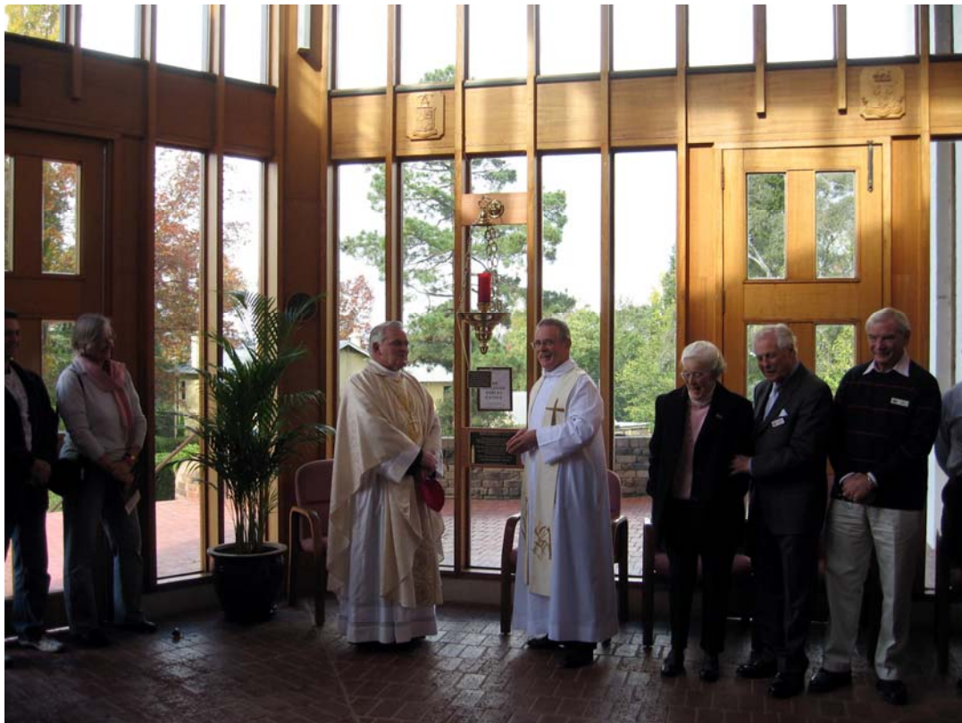
The blessing ceremony

Anglican congregations joined together in the Chapel Narthex for the Blessing of the Deployment Candle and to join together in a prayer for safety for all our deployed personnel. The candle will continue to burn as long as any Australian Serviceman or woman is deployed overseas.