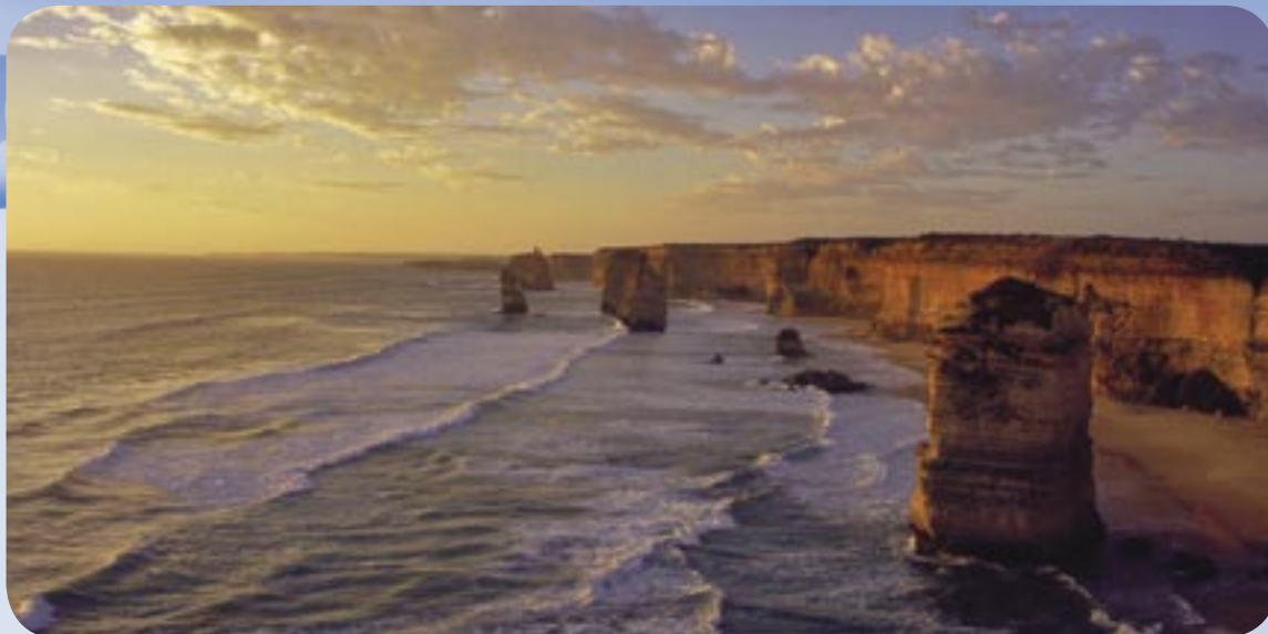
The Twelve Apostles