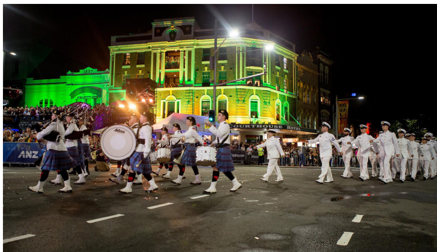
ADFA TOs at Mardi Gras 2017 marching with the Defence LGBTI Information Service (DEFGLIS) Contingent