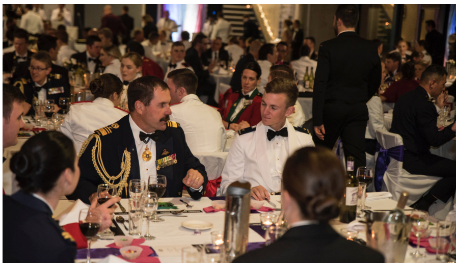
IDAHOT Dinner 2017

There may be occasions where staff are unsure about LGBTI issues or are worried about offending members by saying something inappropriate. Staff are encouraged to respectfully ask questions to clarify these issues, and are welcome to contact any of the support services identified in this guide.