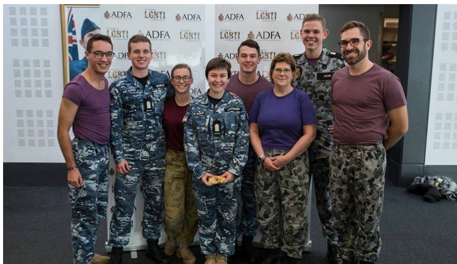
LGBTI Committee 2016 at the Wear It Purple Day